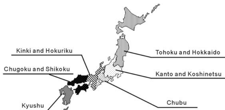
Figure 1 Six branches of JSOI

consists of six local branches (Figure 1), which are responsible for organizing academic conferences and training sessions at designated facilities. They also play important roles in communities by enhancing knowledge and skills necessary for oral implant treatment and providing education and training in oral implantology for local dentists.